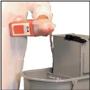
Squeezable 2-liter Proportion Bottle