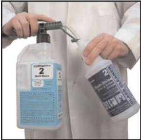
U-Fill Portable Dispensing Gun