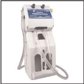
Use in our Wall Mount Dispenser